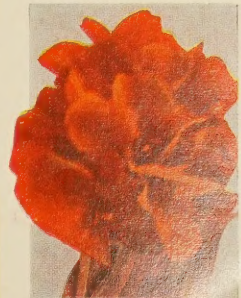
RED KING HUMBERT

GUARANTEE. All bulbs are guaranteed to be true to name and sure to bloom. Our liability, however, is limited to the purchase price of the bulbs.